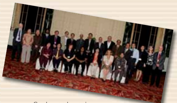
Speakers and organizers of the symposium