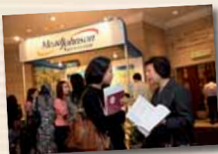
Mead Johnson Nutrition