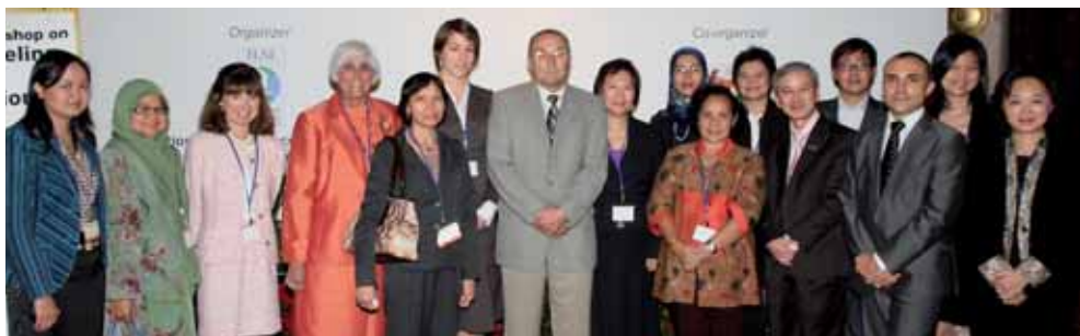
Speakers and Organizers of the Seminar

Singapore: All packaged food must be labeled with a Nutrition Information Panel (NIP) when a nutrition claim is made. The list of more than 60 permitted nutrient function claims is available on AVA's website. Five nutrient-specific diet