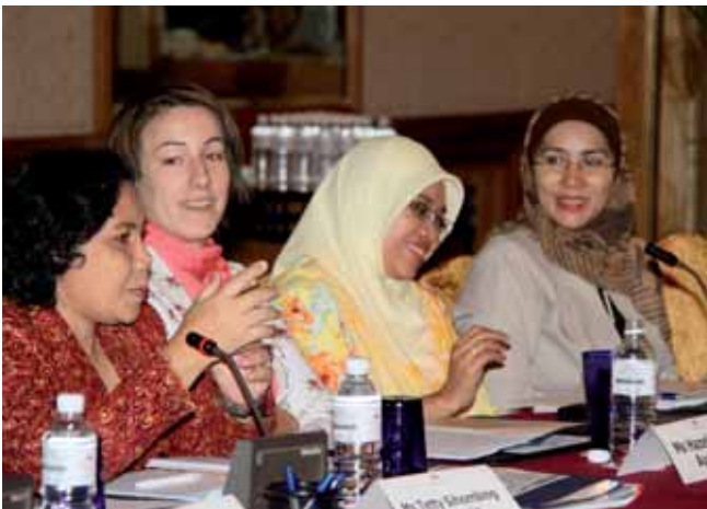
Discussions on FOP labelling for the region

At a workshop session following the seminar, regional regulators exchanged experiences in consumer understanding of nutrition labels and health claims. It was observed that consumers prefer positive claims (e.g. nutrient function claims) over negative claims (e.g. some disease reduction claims). They also concurred that more surveys need to be conducted among the regional consumers to better understand their interpretation and usage of nutrition information and claims. The survey results will help regulatory agencies to develop, review and implement better regulatory systems.