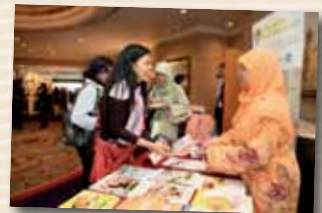
Nutrition Society of Malaysia