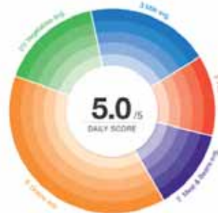
My5 Logo Developed for the Nutrient Rich Coalition