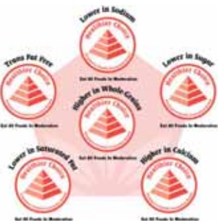
HPB Healthier Choice Symbols

index that measures nutrient density and has been extensively compared with other methods and validated with respect to a healthy diet. The NRF index is based on 9 nutrients to encourage (protein; fiber; vitamins A, C, and E; calcium; iron; potassium; and magnesium) and 3 nutrients to limit (saturated fat, added sugar, and sodium). The NRF index can rank foods based on their nutritional value and can be applied to individual foods, meals, menus, and the daily diet. Dr Drewnowski added that “Communicating nutrient information to the consumer simply, accurately and at a glance is an important aspect of food selection. However, consumers may also be looking for taste, enjoyment, low cost and sustainability.”