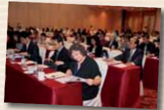
Participants at the symposium session