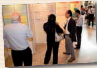
Participants viewing the poster displays

The Symposium on Nutrition and Cognition was attended by over 160 participants. Lively Exhibition and Poster sessions were held alongside the symposium. A total of 17 posters were displayed together with exhibitions and displays by Abbott Nutrition, Martek Biosciences, Mead Johnson Nutrition, Cerebos, ILSI, Nutrition Society of Malaysia and CSIRO. Best Asia Poster awards were given to 3 presenters from Asia in recognition of their effort and to encourage more of such research in the region.